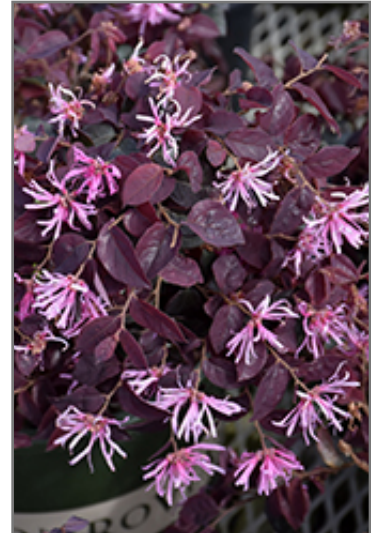
Sizzling Pink Chinese Fringeflower flowers