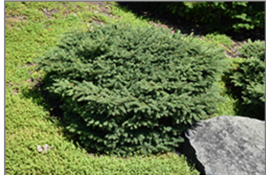
Birds Nest Spruce