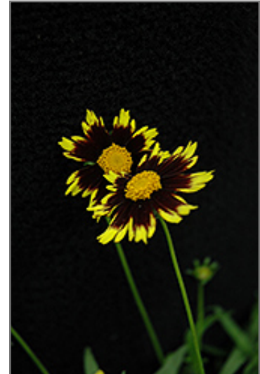
Cosmic Eye Tickseed flowers

Cosmic Eye Tickseed is recommended for the following landscape applications;