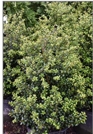
Chesapeake Japanese Holly