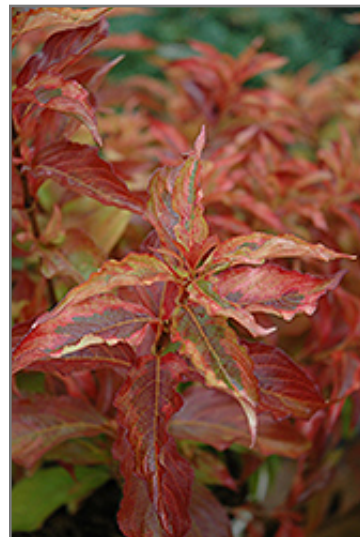
My Monet Sunset Weigela in fall

My Monet Sunset Weigela makes a fine choice for the outdoor landscape, but it is also well-suited for use in outdoor pots and containers. It is often used as a 'filler' in the 'spiller-thriller-filler' container combination, providing a mass of flowers and foliage against which the thriller plants stand out. Note that when grown in a container, it may not perform exactly as indicated on the tag - this is to be expected. Also note that when growing plants in outdoor containers and baskets, they may require more frequent waterings than they would in the yard or garden.