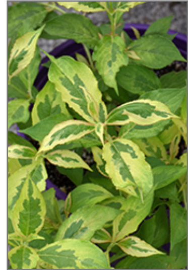
My Monet Sunset Weigela foliage

My Monet Sunset Weigela is recommended for the following landscape applications;