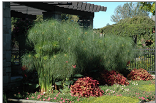
King Tut Egyptian Papyrus