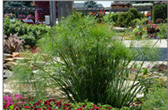
King Tut Egyptian Papyrus