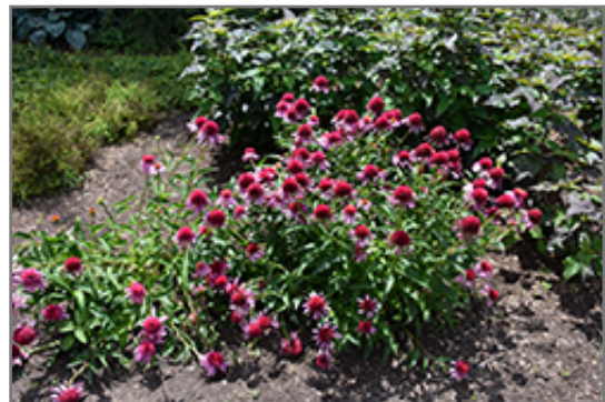
Double Scoop Bubble Gum Coneflower in bloom