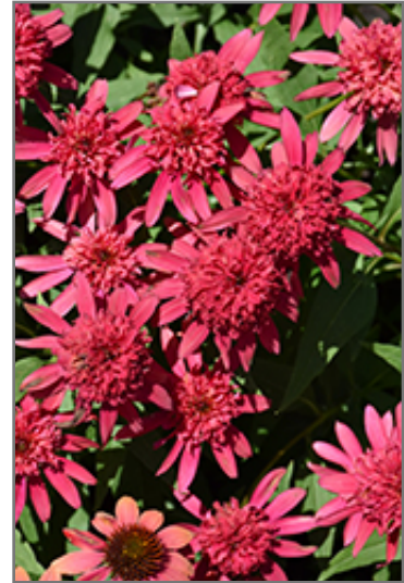
Double Scoop Raspberry Coneflower flowers

Double Scoop Raspberry Coneflower is recommended for the following landscape applications;