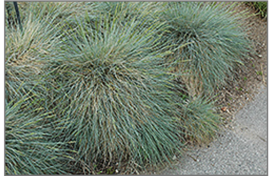
Siskiyou Blue Fescue