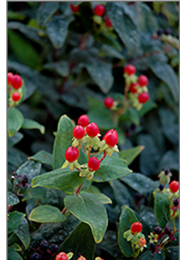
Ignite Red St. John's Wort fruit