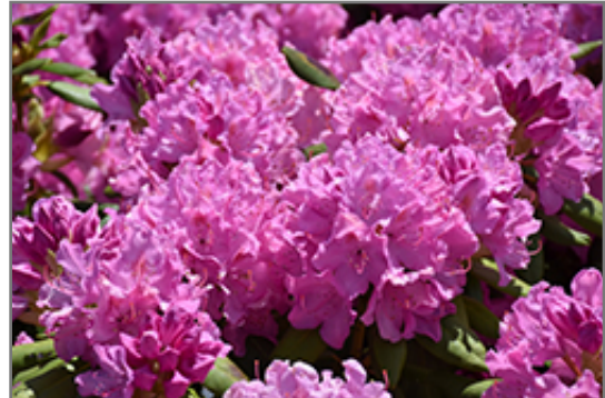
Roseum Elegans Rhododendron flowers

Roseum Elegans Rhododendron is recommended for the following landscape applications;