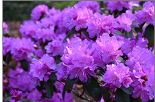
P.J.M. Elite Rhododendron flowers

P.J.M. Elite Rhododendron is recommended for the following landscape applications;