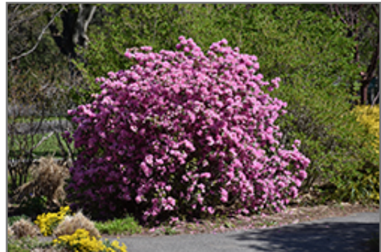
P.J.M. Elite Rhododendron in bloom