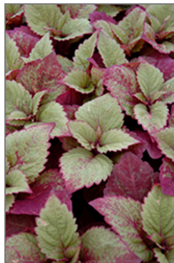
ColorBlaze Royal Glissade Coleus foliage