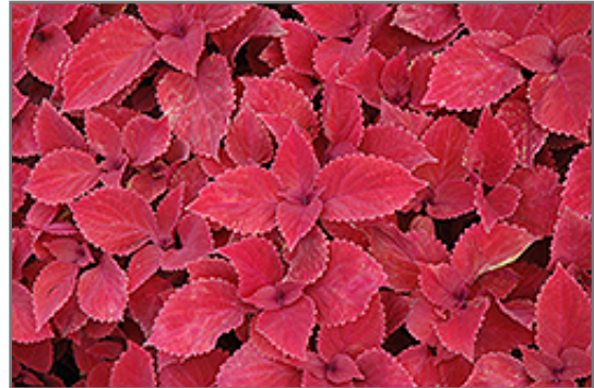
Redhead Coleus foliage