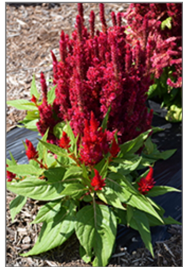
Fresh Look Red Celosia in bloom