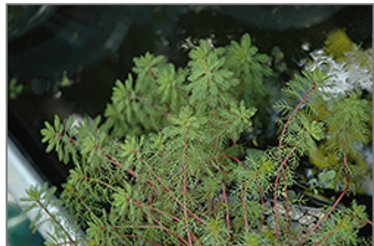
Red Stemmed Parrot Feather foliage