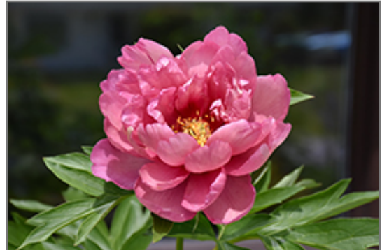
Pink Double Dandy Peony flowers