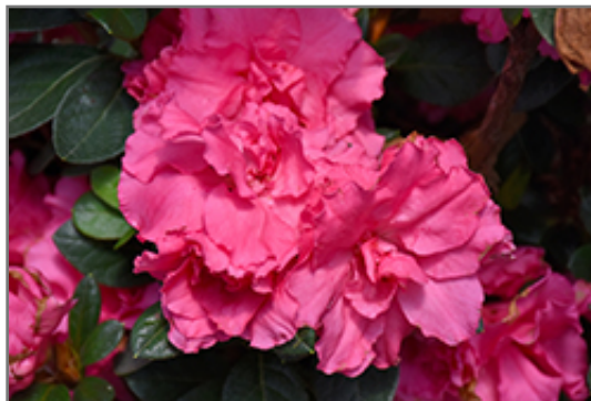
Bloom-A-Thon Pink Double Azalea flowers