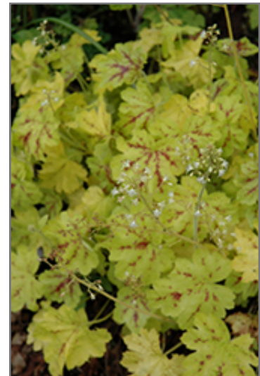
Solar Power Foamy Bells flowers