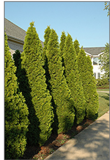
Emerald Green Arborvitae