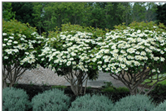
Compact European Cranberry in bloom

Compact European Cranberry is a dense multi-stemmed deciduous shrub with a more or less rounded form. Its average texture blends into the landscape, but can be balanced by one or two finer or coarser trees or shrubs for an effective composition.