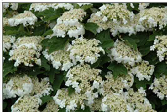
Compact European Cranberry flowers