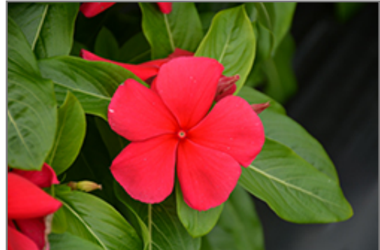
Titan Dark Red Vinca flowers

This plant will require occasional maintenance and upkeep, and should not require much pruning, except when necessary, such as to remove dieback. It is a good choice for attracting butterflies to your yard, but is not particularly attractive to deer who tend to leave it alone in favor of tastier treats. It has no significant negative characteristics.