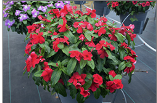
Titan Dark Red Vinca in bloom

Titan Dark Red Vinca is a fine choice for the garden, but it is also a good selection for planting in outdoor containers and hanging baskets. It is often used as a 'filler' in the 'spiller-thriller-filler' container combination, providing a mass of flowers against which the thriller plants stand out. Note that when growing plants in outdoor containers and baskets, they may require more frequent waterings than they would in the yard or garden.