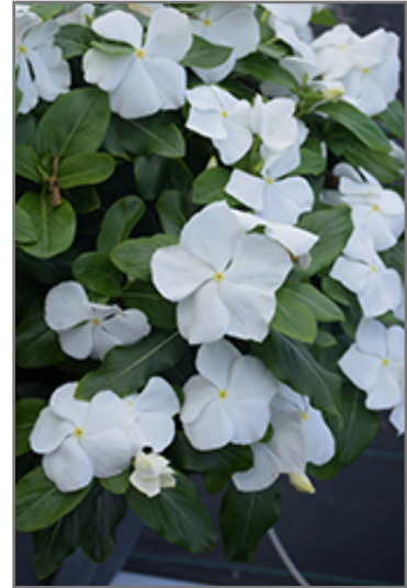
Titan Pure White Vinca flowers

This plant will require occasional maintenance and upkeep, and should not require much pruning, except when necessary, such as to remove dieback. It is a good choice for attracting butterflies to your yard, but is not particularly attractive to deer who tend to leave it alone in favor of tastier treats. It has no significant negative characteristics.