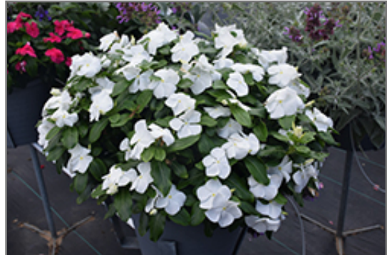
Titan Pure White Vinca in bloom

Titan Pure White Vinca is a fine choice for the garden, but it is also a good selection for planting in outdoor containers and hanging baskets. It is often used as a 'filler' in the 'spiller-thriller-filler' container combination, providing a mass of flowers against which the thriller plants stand out. Note that when growing plants in outdoor containers and baskets, they may require more frequent waterings than they would in the yard or garden.