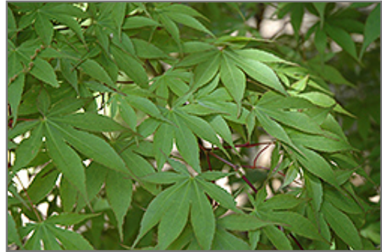
Osakazuki Japanese Maple foliage

This is a relatively low maintenance tree, and should only be pruned in summer after the leaves have fully developed, as it may 'bleed' sap if pruned in late winter or early spring. It has no significant negative characteristics.