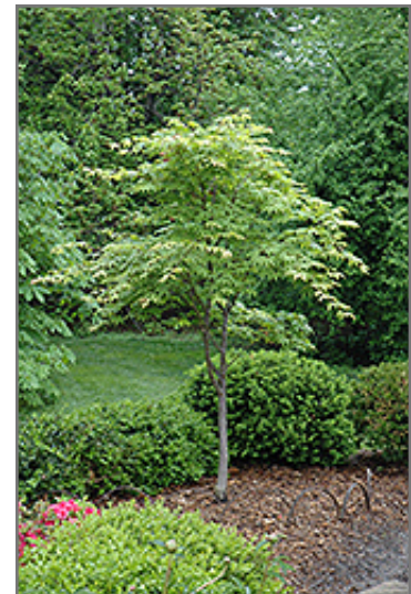
Osakazuki Japanese Maple