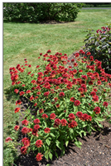
Double Scoop Orangeberry Coneflower in bloom