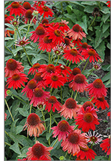
Sombrero Salsa Red Coneflower flowers

This is a relatively low maintenance plant, and is best cleaned up in early spring before it resumes active growth for the season. It is a good choice for attracting butterflies to your yard, but is not particularly attractive to deer who tend to leave it alone in favor of tastier treats. It has no significant negative characteristics.