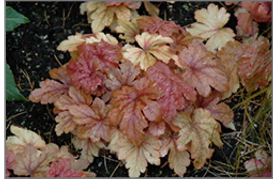
Buttered Rum Foamy Bells

Buttered Rum Foamy Bells is recommended for the following landscape applications;