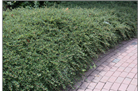
Coral Beauty Cotoneaster

Coral Beauty Cotoneaster is a multi-stemmed evergreen shrub with a shapely form and gracefully arching branches. It lends an extremely fine and delicate texture to the landscape composition which should be used to full effect.