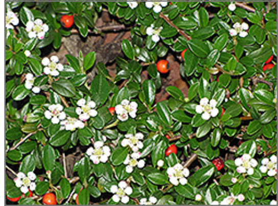
Coral Beauty Cotoneaster fruit