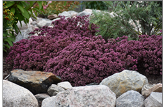
Cherry Tart Stonecrop in bloom

Cherry Tart Stonecrop is a dense herbaceous perennial with an upright spreading habit of growth. Its medium texture blends into the garden, but can always be balanced by a couple of finer or coarser plants for an effective composition.