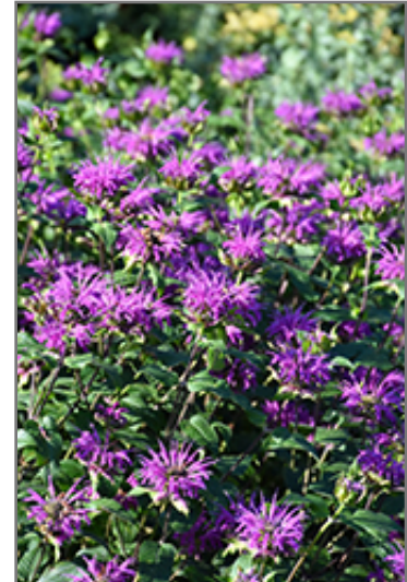
Dark Ponticum Beebalm flowers