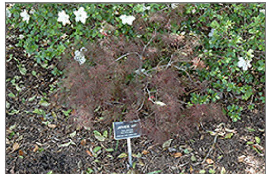
Red Feathers Japanese Maple