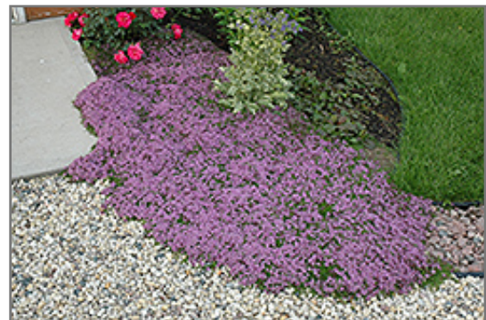
Red Creeping Thyme in bloom