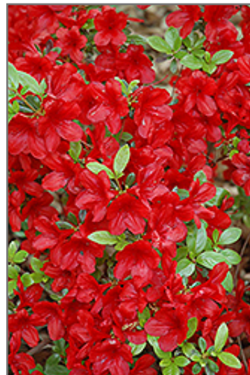
Midnight Flare Azalea flowers