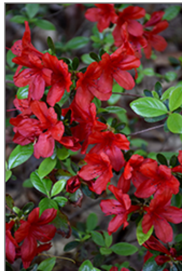
Midnight Flare Azalea flowers

Midnight Flare Azalea makes a fine choice for the outdoor landscape, but it is also well-suited for use in outdoor pots and containers. With its upright habit of growth, it is best suited for use as a 'thriller' in the 'spiller-thriller-filler' container combination; plant it near the center of the pot, surrounded by smaller plants and those that spill over the edges. It is even sizeable enough that it can be grown alone in a suitable container. Note that when grown in a container, it may not perform exactly as indicated on the tag - this is to be expected. Also note that when growing plants in outdoor containers and baskets, they may require more frequent waterings than they would in the yard or garden.