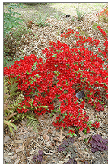
Midnight Flare Azalea in bloom