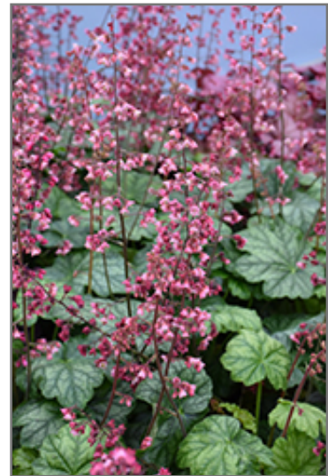
Berry Timeless Coral Bells flowers