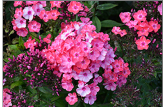
Garden Girls Glamour Girl Garden Phlox flowers

Garden Girls Glamour Girl Garden Phlox is recommended for the following landscape applications;