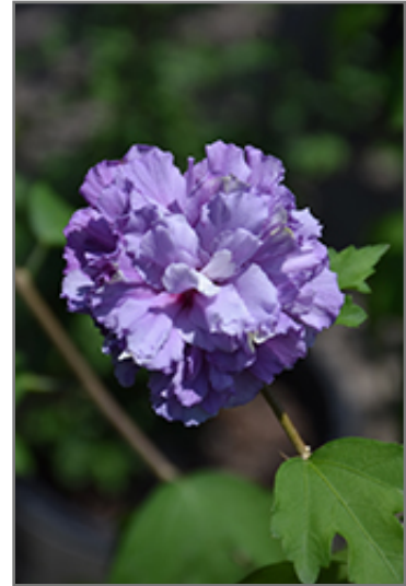
Blueberry Smoothie Rose of Sharon flowers

Blueberry Smoothie Rose of Sharon is recommended for the following landscape applications;