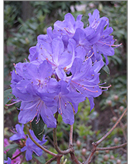
Blue Baron Rhododendron flowers