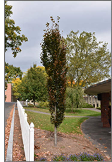
Dawyck Purple Beech

Dawyck Purple Beech is recommended for the following landscape applications;