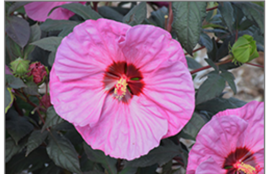
Summerific Berry Awesome Hibiscus flowers

Summerific Berry Awesome Hibiscus is recommended for the following landscape applications;