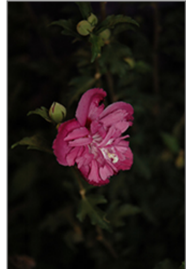
Raspberry Smoothie Rose of Sharon flowers

Raspberry Smoothie Rose of Sharon is recommended for the following landscape applications;