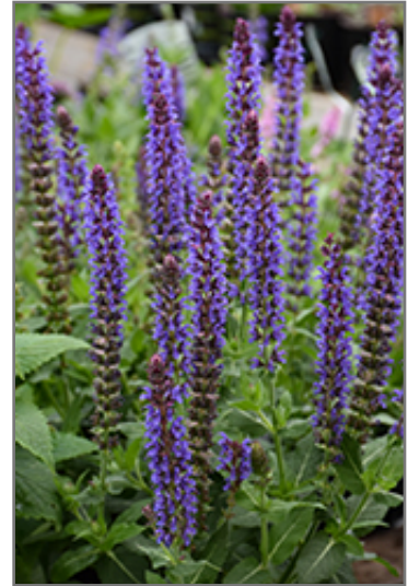
Violet Riot Sage flowers

This is a relatively low maintenance plant, and is best cleaned up in early spring before it resumes active growth for the season. It is a good choice for attracting butterflies and hummingbirds to your yard, but is not particularly attractive to deer who tend to leave it alone in favor of tastier treats. It has no significant negative characteristics.