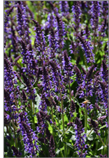
Violet Riot Sage flowers

Violet Riot Sage is a fine choice for the garden, but it is also a good selection for planting in outdoor pots and containers. With its upright habit of growth, it is best suited for use as a 'thriller' in the 'spiller-thriller-filler' container combination; plant it near the center of the pot, surrounded by smaller plants and those that spill over the edges. Note that when growing plants in outdoor containers and baskets, they may require more frequent waterings than they would in the yard or garden.