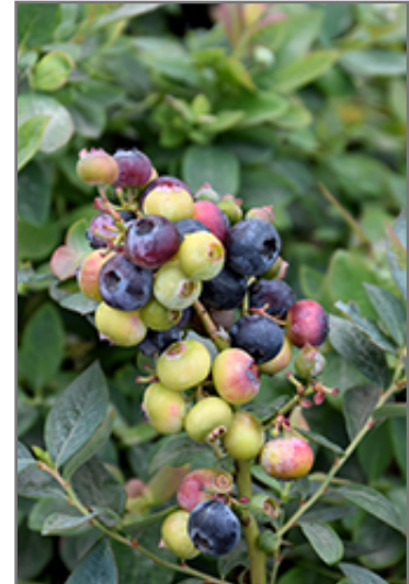
Pink Icing Blueberry fruit

Pink Icing Blueberry features dainty clusters of white bell-shaped flowers with shell pink overtones hanging below the branches in mid spring, which emerge from distinctive pink flower buds. It has bluish-green deciduous foliage which emerges pink in spring. The glossy oval leaves turn an outstanding aqua bluish-green in the fall. It features an abundance of magnificent blue berries in mid summer.