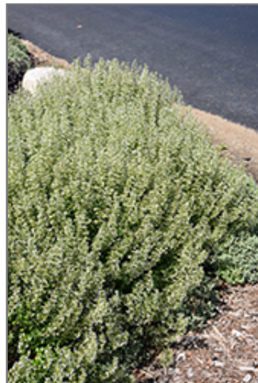
White Cloud Dwarf Calamint in bloom