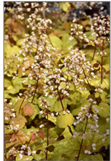
Champagne Coral Bells flowers