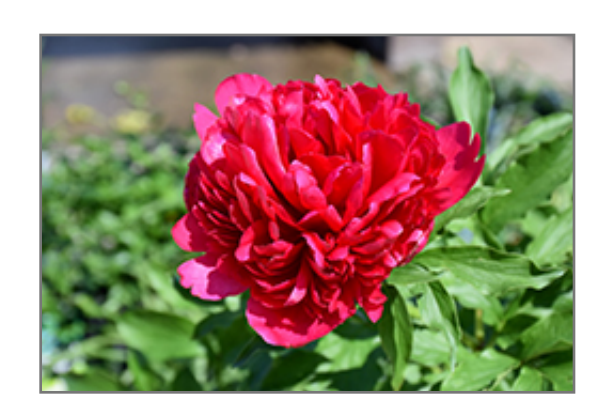
Many Happy Returns Peony flowers