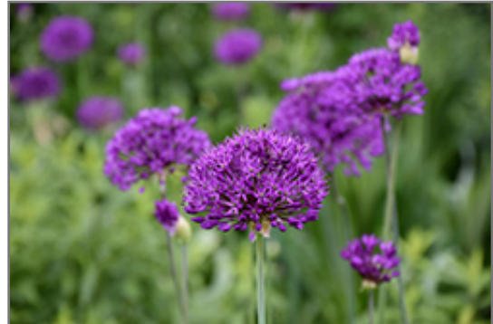
Purple Sensation Ornamental Onion flowers

Purple Sensation Ornamental Onion is an open herbaceous perennial with tall flower stalks held atop a low mound of foliage. Its relatively coarse texture can be used to stand it apart from other garden plants with finer foliage.