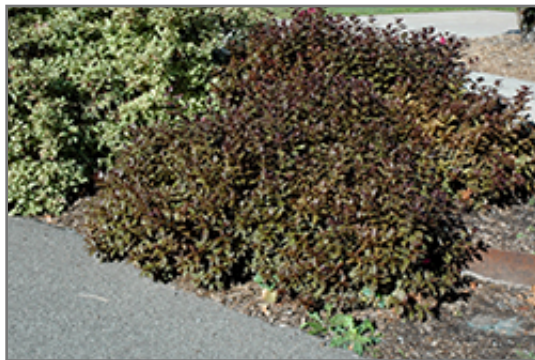
Minor Black Weigela

Minor Black Weigela makes a fine choice for the outdoor landscape, but it is also well-suited for use in outdoor pots and containers. Because of its height, it is often used as a 'thriller' in the 'spiller-thriller-filler' container combination; plant it near the center of the pot, surrounded by smaller plants and those that spill over the edges. It is even sizeable enough that it can be grown alone in a suitable container. Note that when grown in a container, it may not perform exactly as indicated on the tag - this is to be expected. Also note that when growing plants in outdoor containers and baskets, they may require more frequent waterings than they would in the yard or garden.