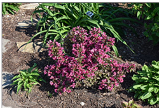
Minor Black Weigela in bloom