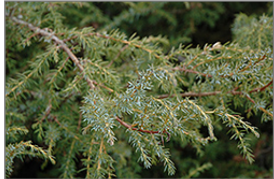
Common Juniper foliage