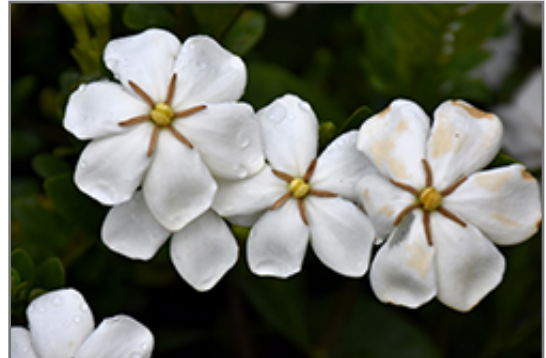
Kleim's Hardy Gardenia flowers

When grown indoors, Kleim's Hardy Gardenia can be expected to grow to be about 3 feet tall at maturity, with a spread of 3 feet. It grows at a slow rate, and under ideal conditions can be expected to live for approximately 30 years. This houseplant will do well in a location that gets either direct or indirect sunlight, although it will usually require a more brightly-lit environment than what artificial indoor lighting alone can provide. It does best in average to evenly moist soil, but will not tolerate standing water. The surface of the soil shouldn't be allowed to dry out completely, and so you should expect to water this plant once and possibly even twice each week. Be aware that your particular watering schedule may vary depending on its location in the room, the pot size, plant size and other conditions; if in doubt, ask one of our experts in the store for advice. It is not particular as to soil pH, but grows best in rich soil. Contact the store for specific recommendations on pre-mixed potting soil for this plant.