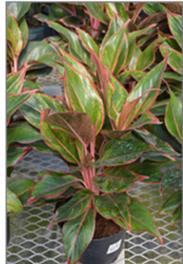
Siam Aurora Chinese Evergreen in full